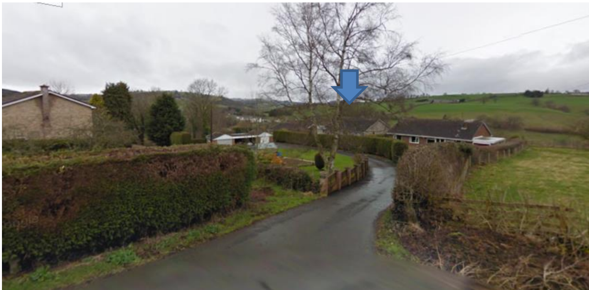
Access road to property